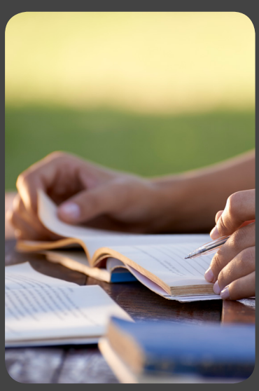
option 2-MAIL-IN BOOKLETS

Distance students can choose to receive instruction through Essential Education, a software program with thousands of interactive lessons, practice tests and activities that are personalized to each individual's current education and skill level. Students will have 24/7 access to this software and can work at their own pace. Students are also welcome to participate in live video classes with SCC instructors through Google Meet during the week at no cost.