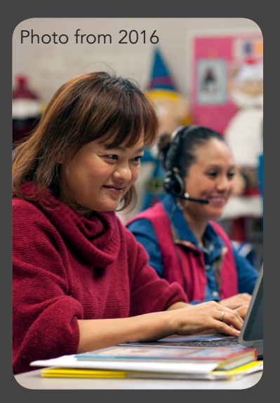
option 3- IN-PERSON INSTRUCTION

For those without reliable in- Students can receive in-person prepaid postage provided by the college. Upon successful completion of the booklets, students will be able to register for the official High School Equivalency test.