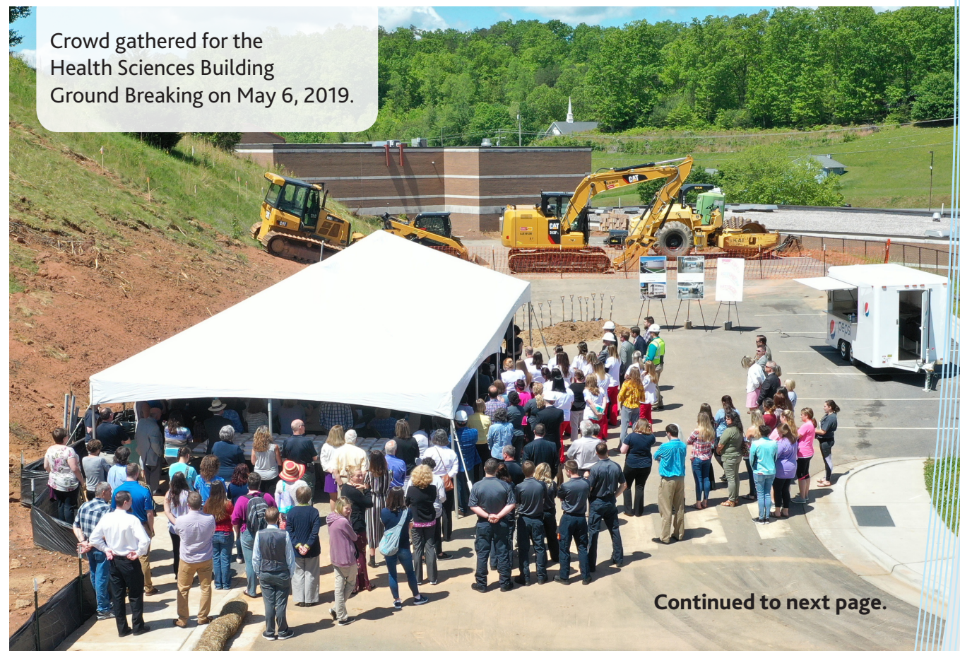
Crowd gathered for the Health Sciences Building Ground Breaking on May 6, 2019.