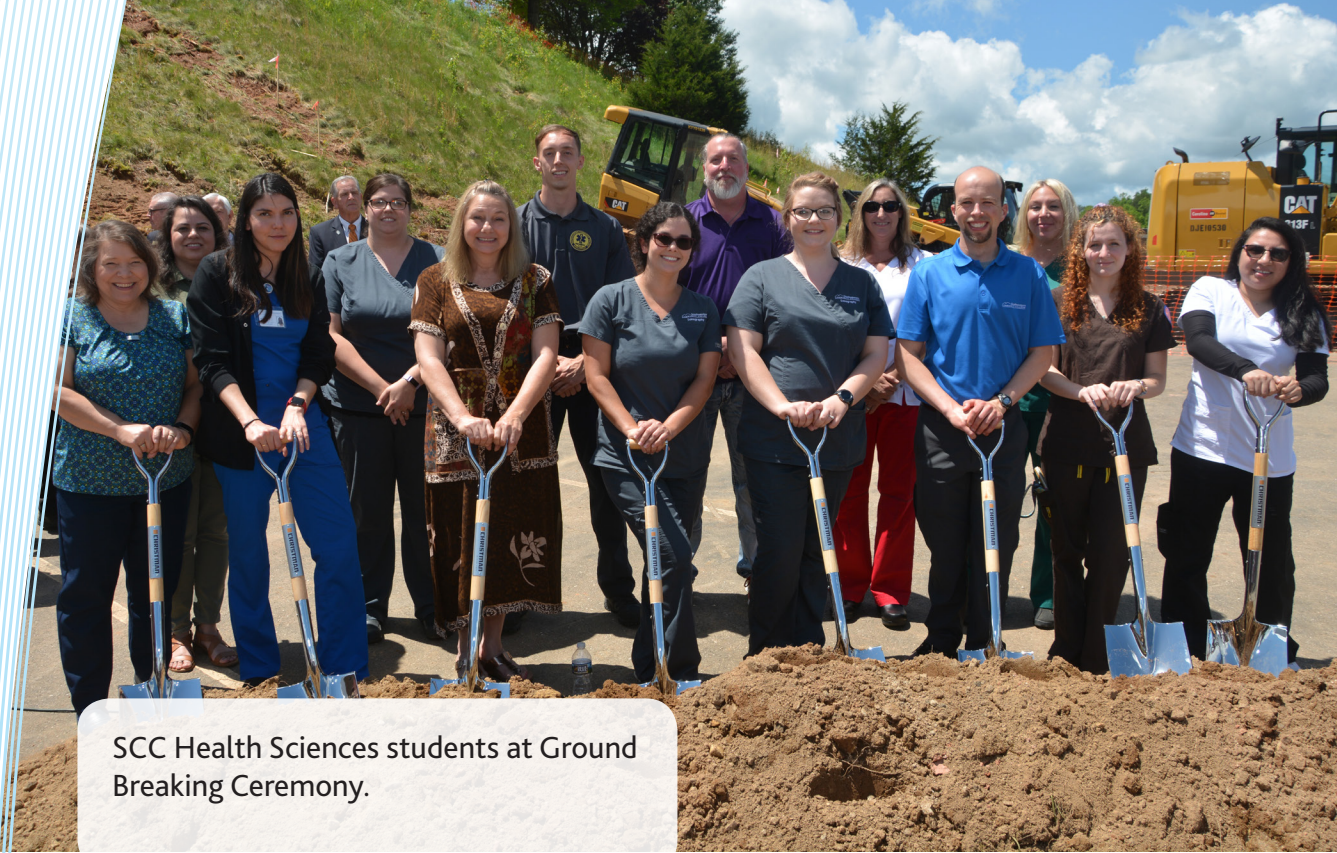
SCC Health Sciences students at Ground Breaking Ceremony.