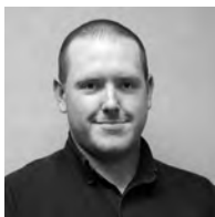
Travis Scruggs Fire and Rescue Program