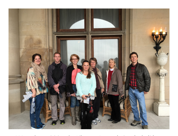
SSS students visiting the Biltmore Estate during the holidays.